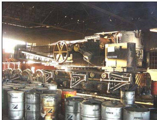
Two views of one of these magnificent machines awaiting its fate in Kimberly.